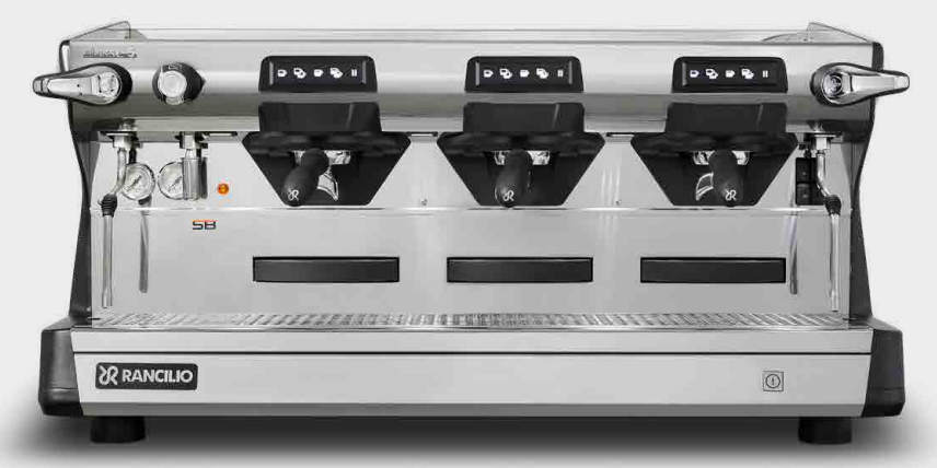
C5 USB 3GR TALL